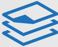
Print on Demand